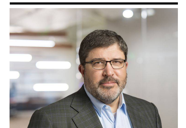
Copyright © 2025 Fisher Phillips LLP. All Rights Reserved.