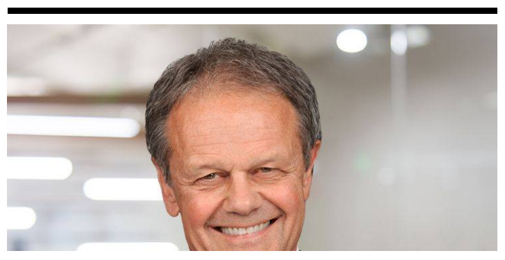
Copyright © 2025 Fisher Phillips LLP. All Rights Reserved.