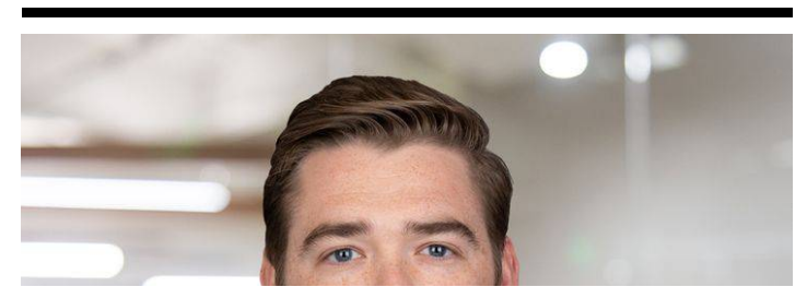
Copyright © 2025 Fisher Phillips LLP. All Rights Reserved.