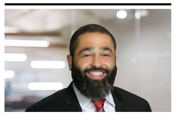
Copyright © 2025 Fisher Phillips LLP. All Rights Reserved.