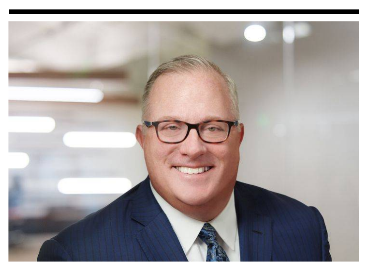
Copyright © 2025 Fisher Phillips LLP. All Rights Reserved.