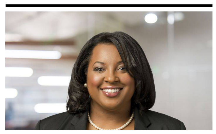
Copyright © 2025 Fisher Phillips LLP. All Rights Reserved.