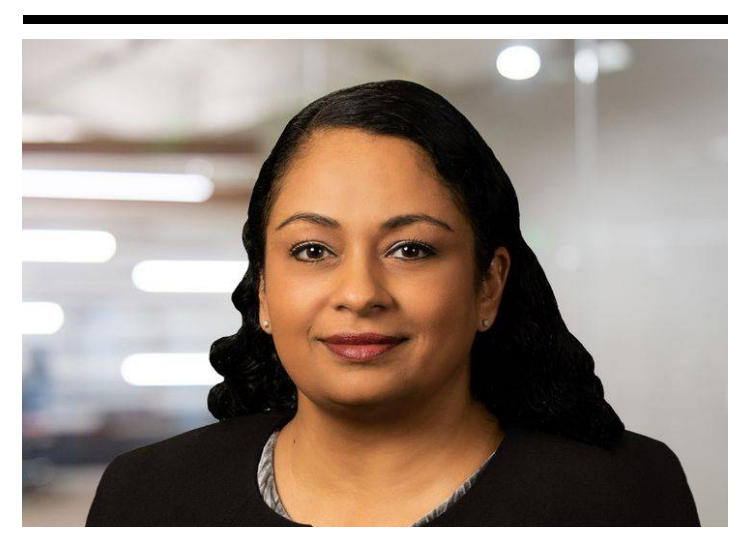
Copyright © 2025 Fisher Phillips LLP. All Rights Reserved.