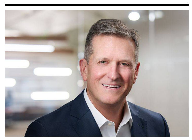
Copyright © 2025 Fisher Phillips LLP. All Rights Reserved.