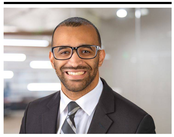
Copyright © 2024 Fisher Phillips LLP. All Rights Reserved.