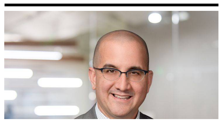
Copyright © 2025 Fisher Phillips LLP. All Rights Reserved.