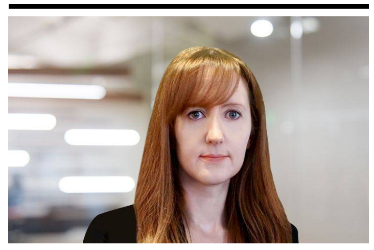
Copyright © 2025 Fisher Phillips LLP. All Rights Reserved.