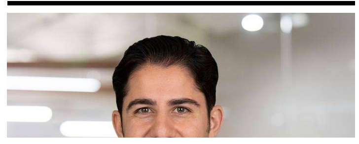
Copyright © 2025 Fisher Phillips LLP. All Rights Reserved.