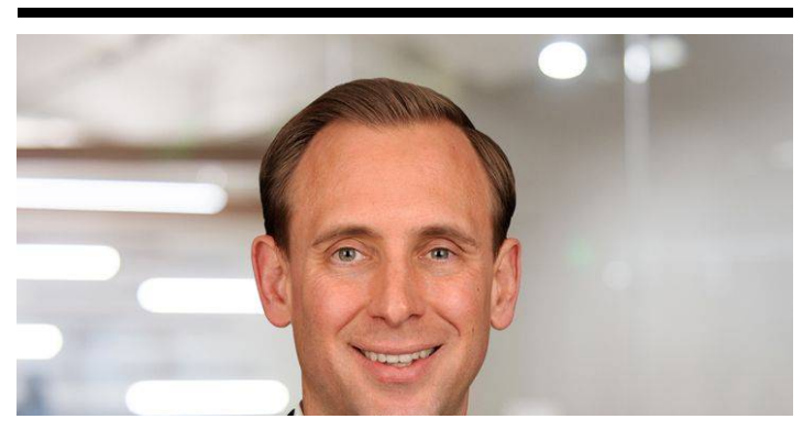
Copyright © 2025 Fisher Phillips LLP. All Rights Reserved.