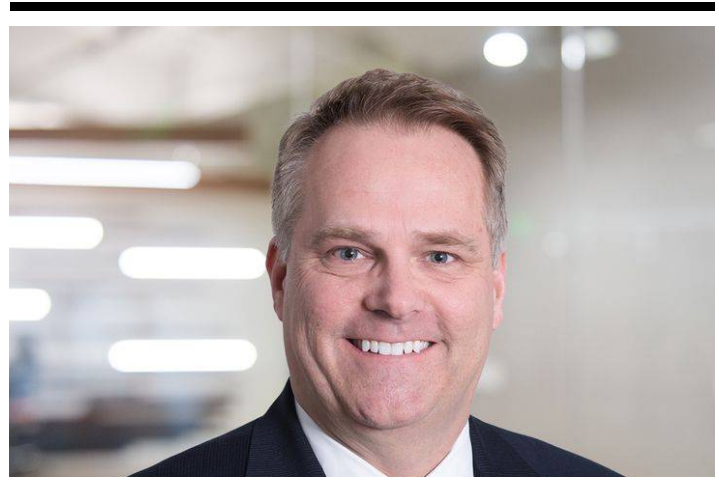
Copyright © 2025 Fisher Phillips LLP. All Rights Reserved.